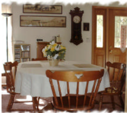
Dining area downstairs

Check-in 3 to 6 PM Check-out 12 noon Arrangements can be made for early or later check-in* *with prior notification